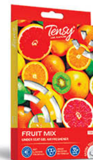
Fruit Mix TDD-08

Air freshener in gel, 110 g. Classic fragrances, from fruity and flower scents to perfume compositions, are fixed under a car seat (it's recommended to fix it under a passenger seat to avoid the air freshener sticking under the driver's pedals). It's best to be fixed near vent holes for a better dispersion of scents. The package has a fragrance tester!