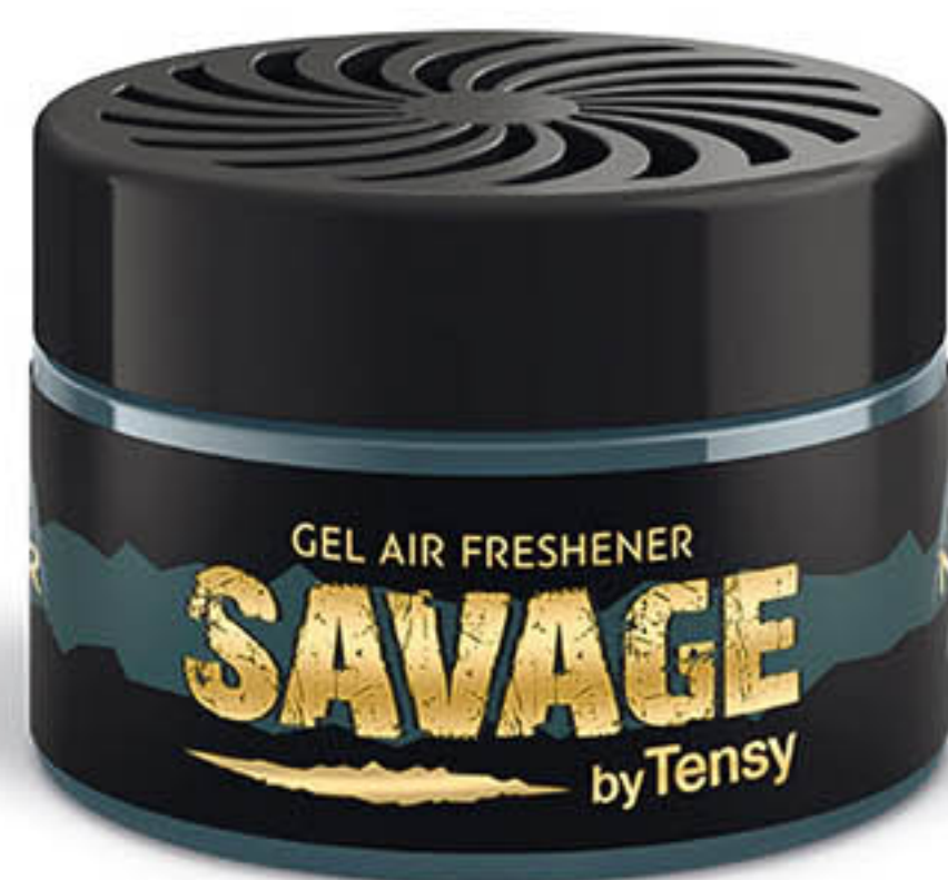
New Car TZ-101