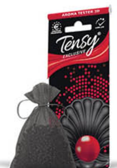
Charm (analogous to Donna Noir Absolu) TTE-23