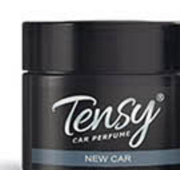
New Car KZ-07