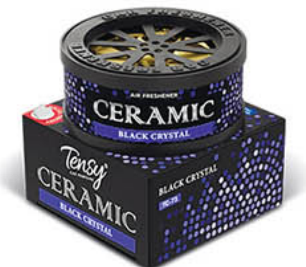
Black Crystal TC-73