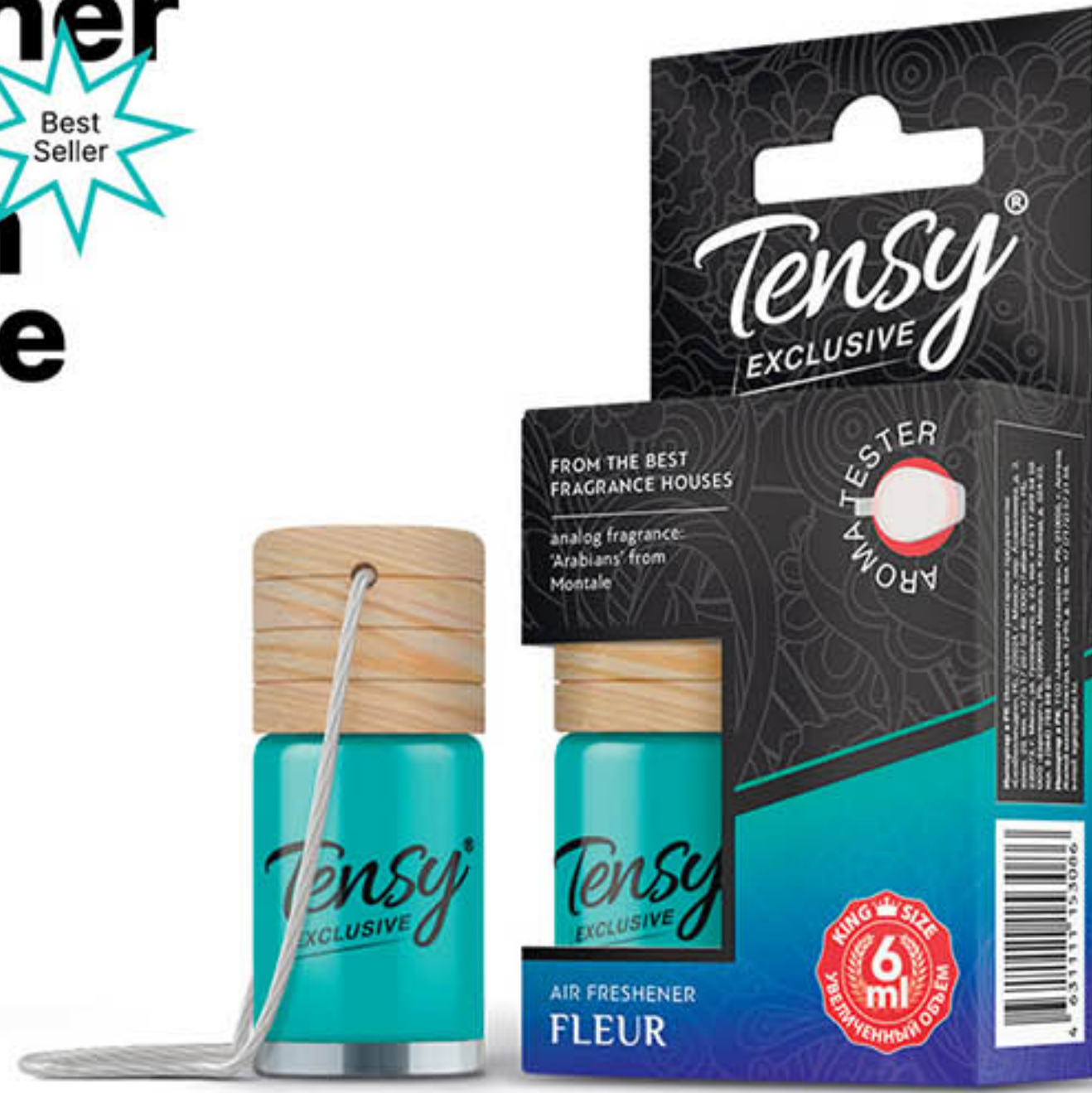
Fleur (analogous to Arabians) TB-27

Glass bottle. The cap is made of beech. The fragrance essence is delivered from leading European manufacturers. The liquid inside the bottle is colored to match the color of the package. The package has a fragrance tester.