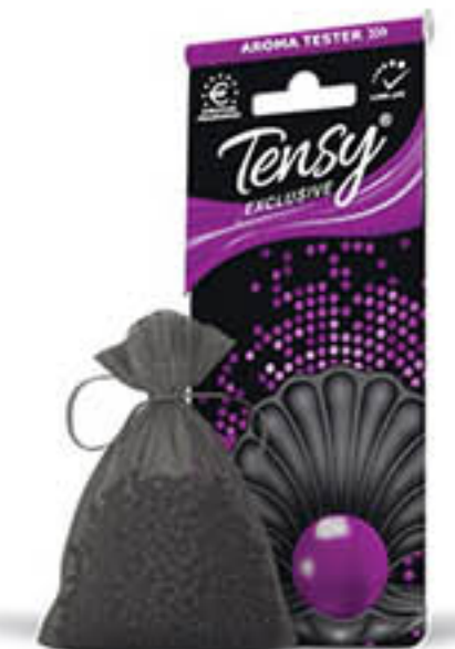
Belle (analogous to I Don't Need A Prince By My Side To Be A Princess) TTE-21