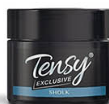
Sholk (analogous to Tresor La Nuit) KZ-24