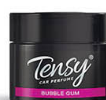
Bubble Gum KZ-05