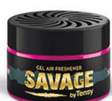
Sex Elixir TZ-102