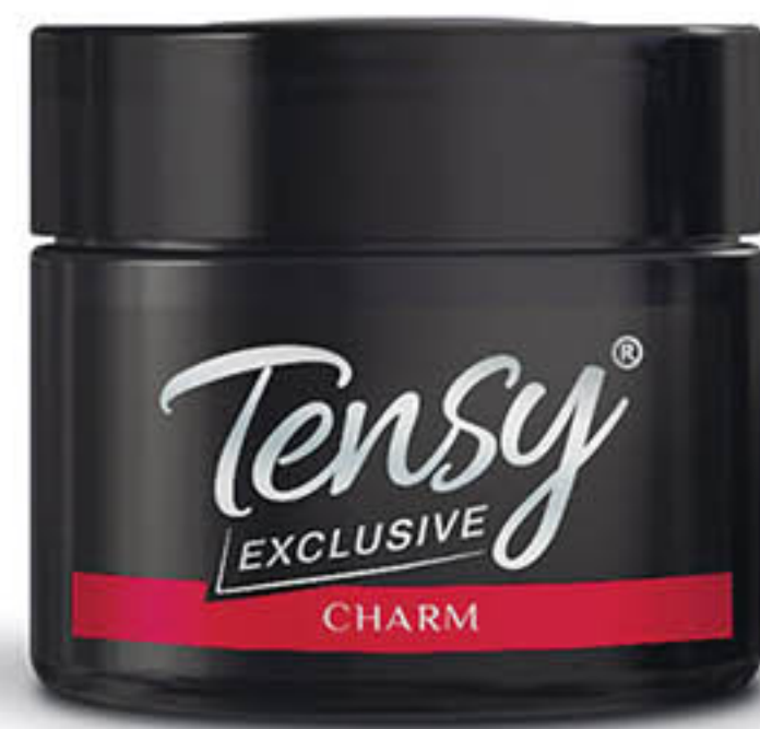
Charm (analogous to Donna Noir Absolu) KZ-25

A classic plastic bottle filled with water gel with a perfumed fragrance. It can be fixed on a dashboard or placed in a cup holder. The package has a fragrance tester.