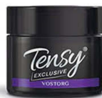
Vosotrg (analogous to La Vie Est Belle) KZ-21