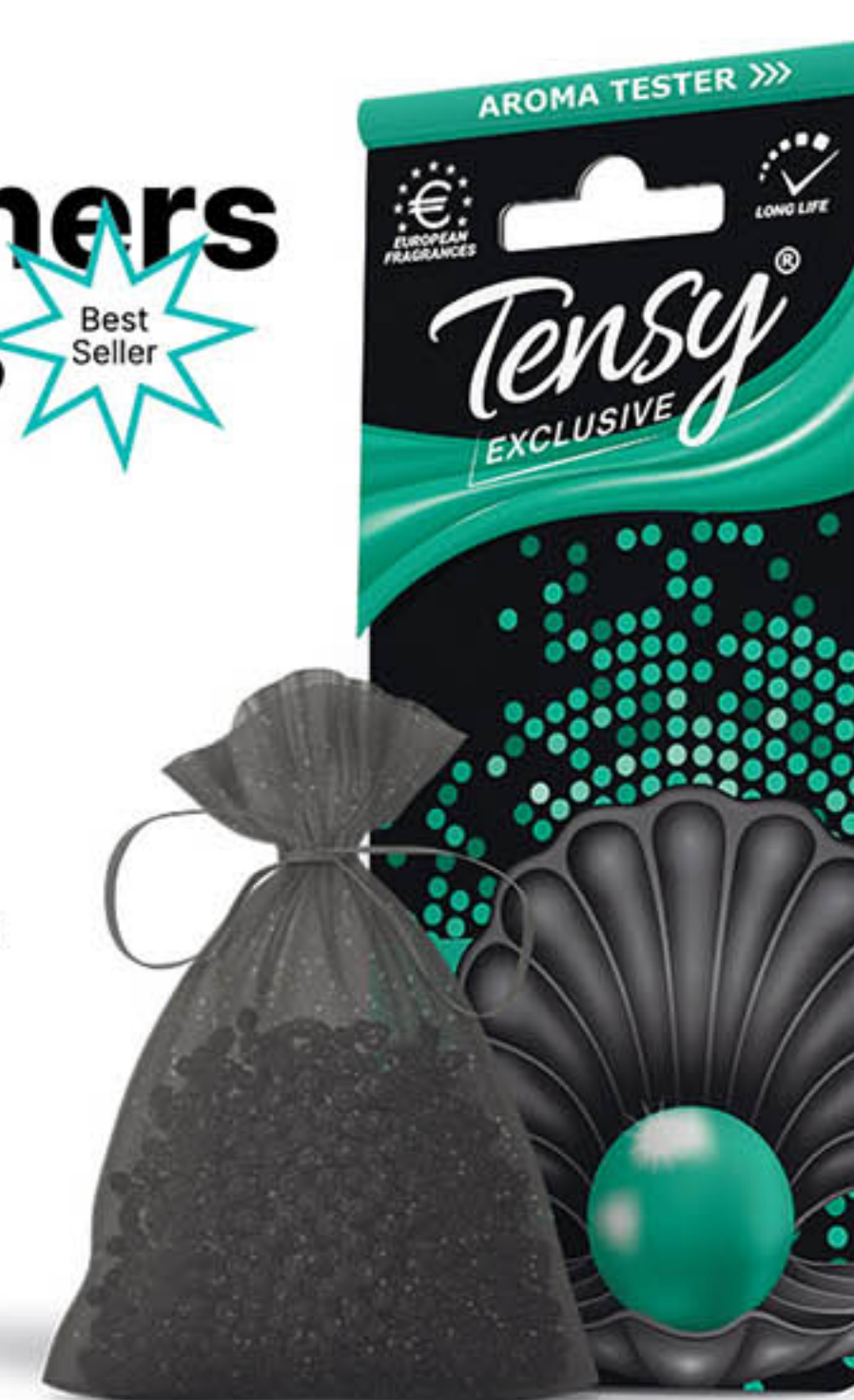
Barkhat (analogous to Eau Fraiche) TTE-22

Tensy bottle Exclusive mix (granule) 12 units on a poster / 14 posters in a box