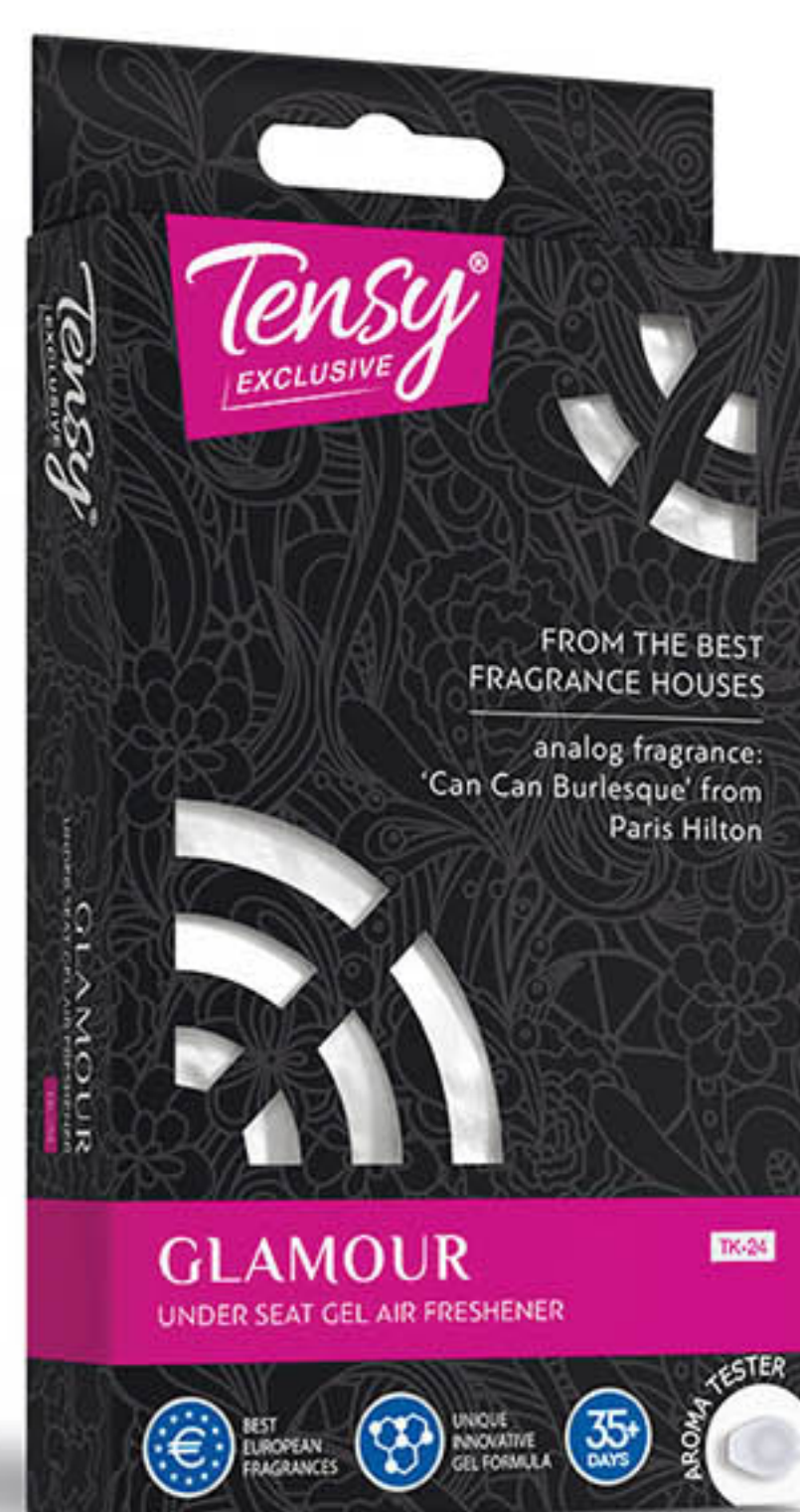
Glamour (analogous to Can-Can Burlesque) TK-24

Perfumed air fresheners. A series of gel air fresheners with fragrances analogous to perfumes of well-known brands. It's recommended to fix the air freshener close to vent holes to let it disperse the fragrance better inside the car. The package has a fragrance tester.