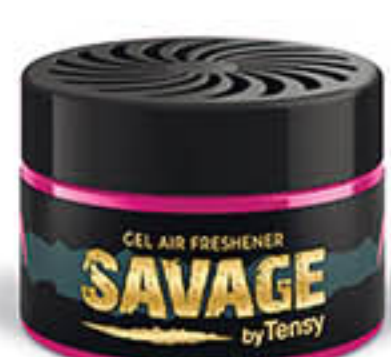
Bubble Gum TZ-103