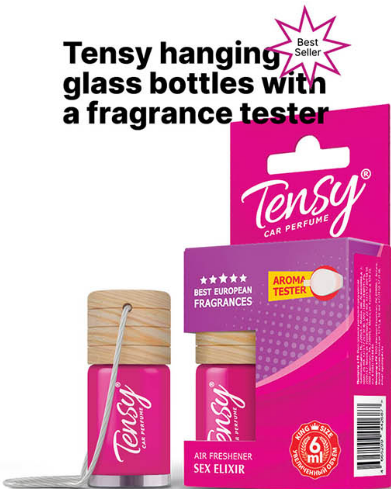
Sex Elixir TB-03