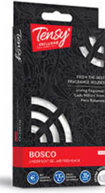
Bosco (analogous to One Million) TK-23