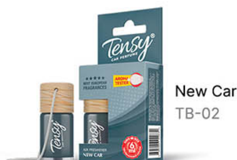
New Car TB-02