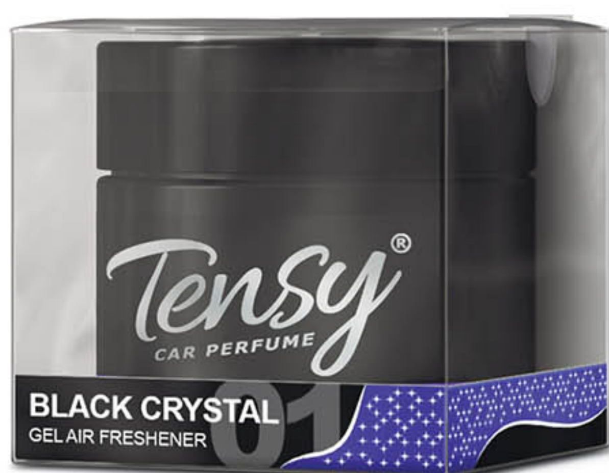
Black Crystal KZ-01