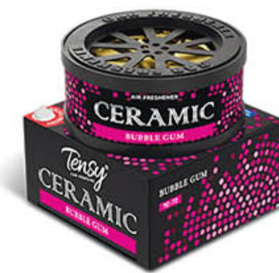
Bubble Gum TC-72