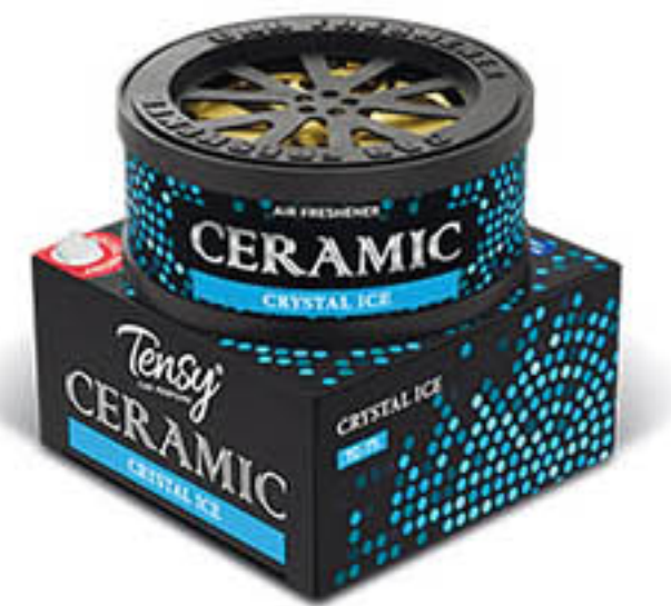
Crystal Ice TC-75