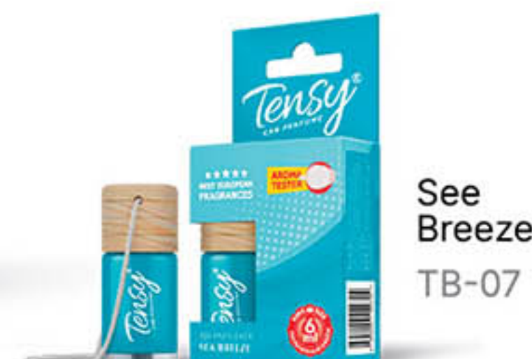
See Breeze TB-07

An air freshener in a glass bottle is classic. What makes us stand out of our competitors is a bigger volume — 6 ml. We buy all the fragrance essences from leading European manufacturers: from fruity and flower scents up to compound perfumed ones. The cap is made of a precious kind of wood - beech. Thanks to its nice pattern our air fresheners are a good decoration for any car. The liquid in the bottles is colored with different colors.