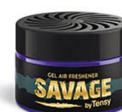
Black Crystal TZ-107