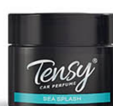
See Splash KZ-04