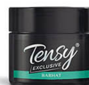
Barkhat (analogous to Eau Fraiche) KZ-23