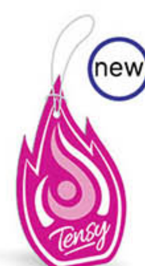
Sex Elixir TA-58