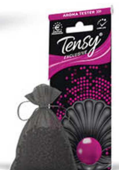
Glamour (analogous to Can-Can Burlesque) TTE-24