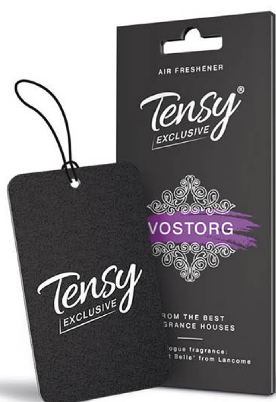
Vostorg (analogous to La vie es belle) TA-21

is created on the base of perfumes of the best European perfume brands