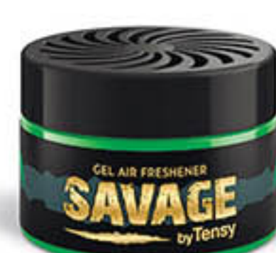
Green Apple TZ-104