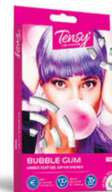
Bubble Gum TDD-01