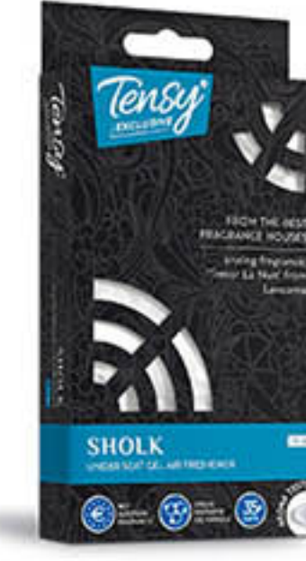
Sholk (analogous to Tresor La Nuit) TK-26