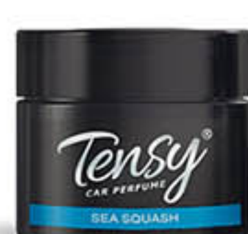
Sea Squash KZ-03