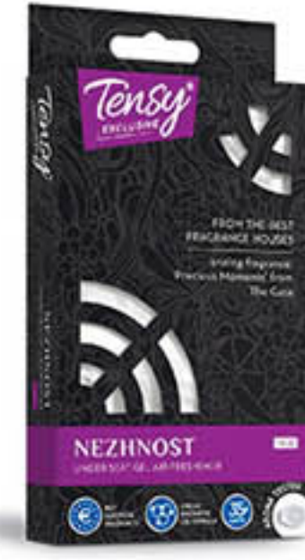
Nezhnost (analogous to I Don't Need A Prince By My Side To Be A Princess) TK-22