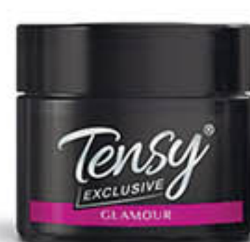
Glamour (analogous to Can-Can Burlesque) KZ-22