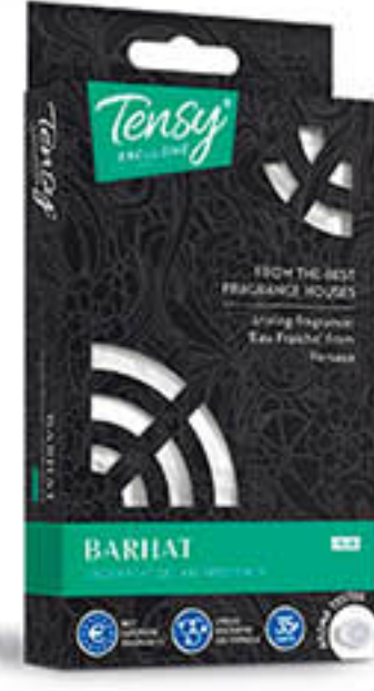
Barkhat (analogous to Eau Fraiche) TK-25