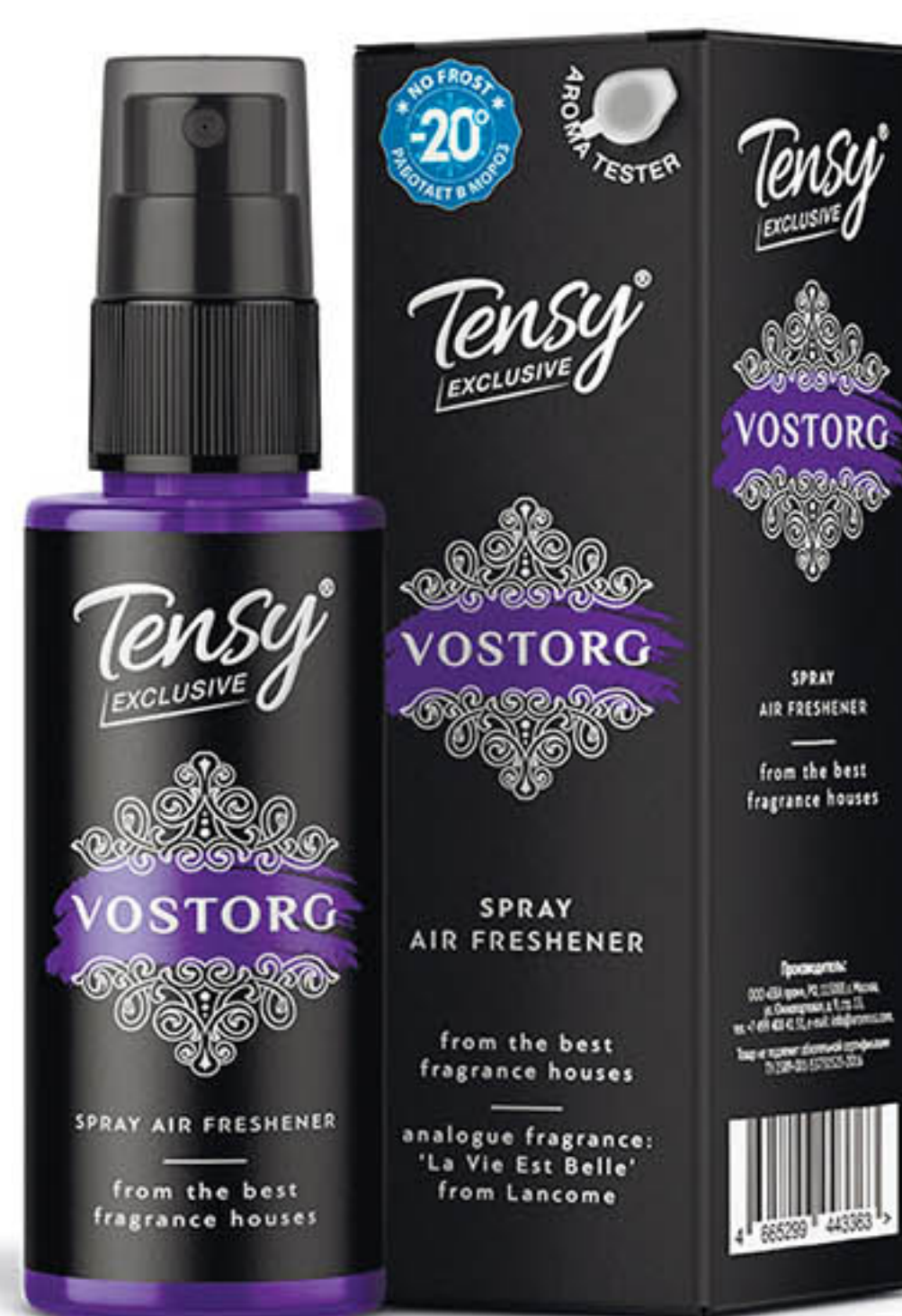
Vostorg (analogous to La vie es belle) TSS-21

Perfumed air fresheners in spray, 50 ml. You can extend the lifetime of your cardboard air freshener applying a spray to it. You can use the air freshener everywhere.