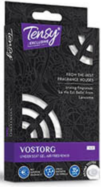
Vosotrg (analogous to La Vie Est Belle) TK-21