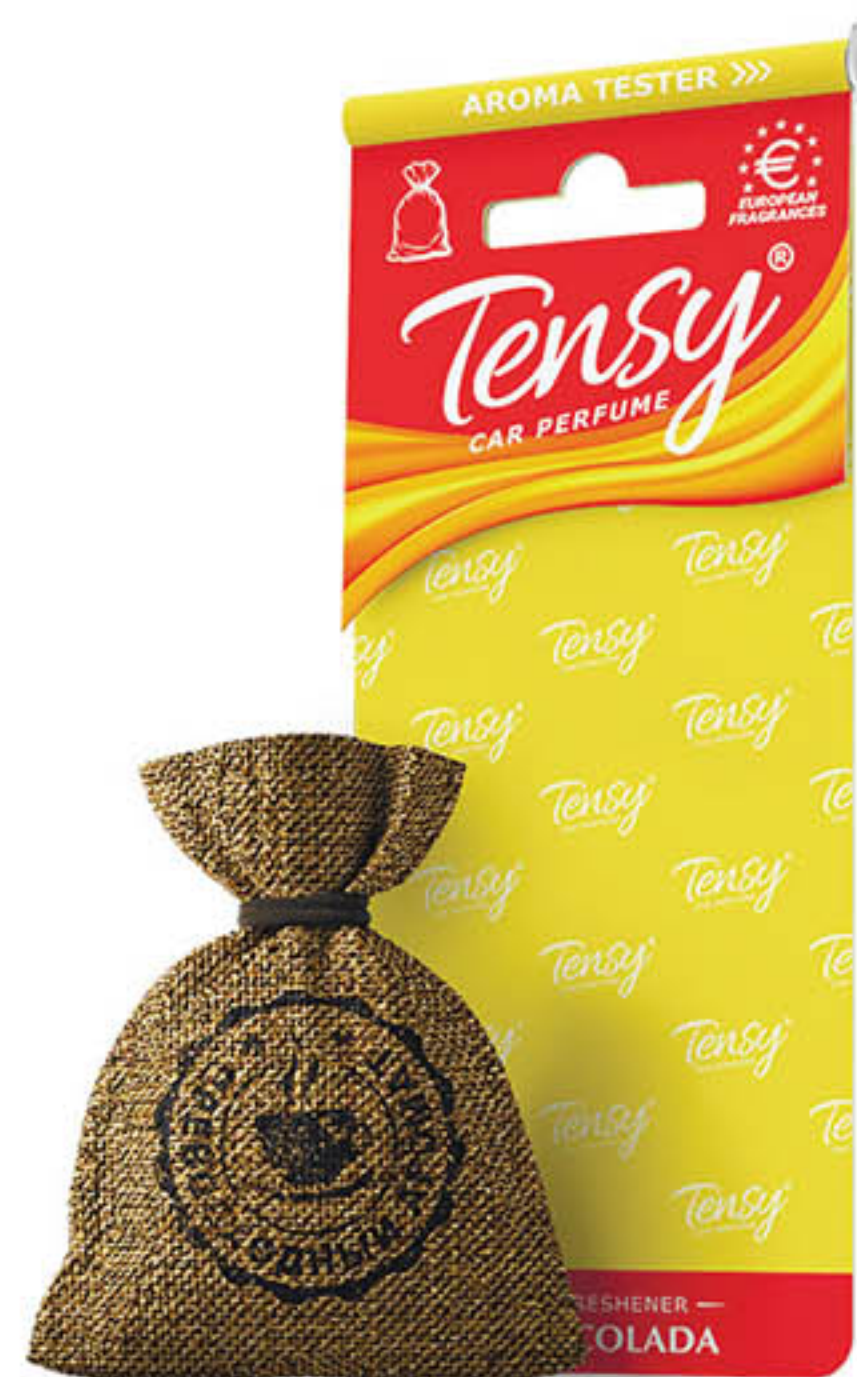
Pina Colada TME-01

13 fabric bags with natural filling will leave nobody indifferent, they will be an excellent decoration for any car. The lifetime of the air freshener can be longer if sprayed with a spray air freshener of our TSS series. The air freshener has a fragrance tester.