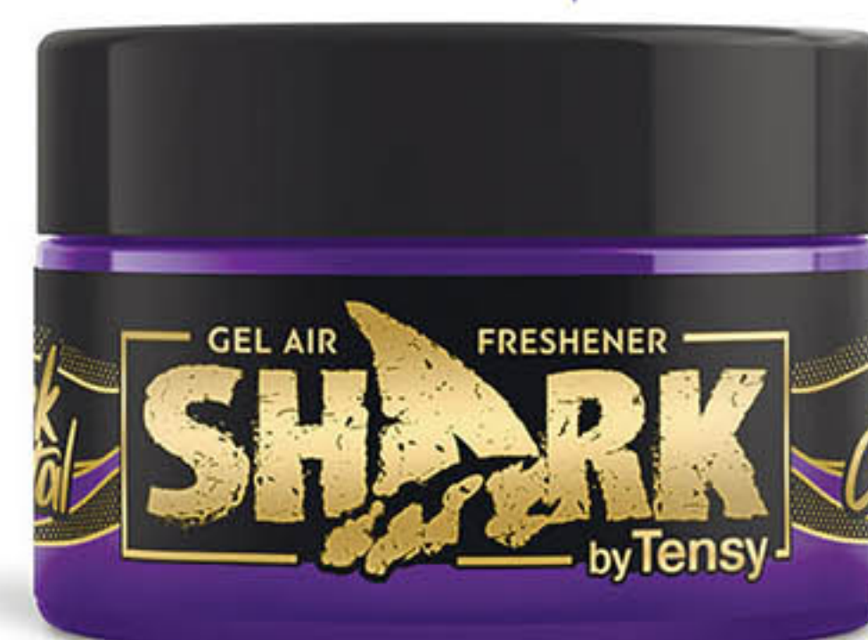
Black Crystal TZ-01 SHARK