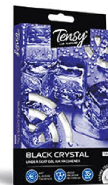
Black Crystal TDD-03